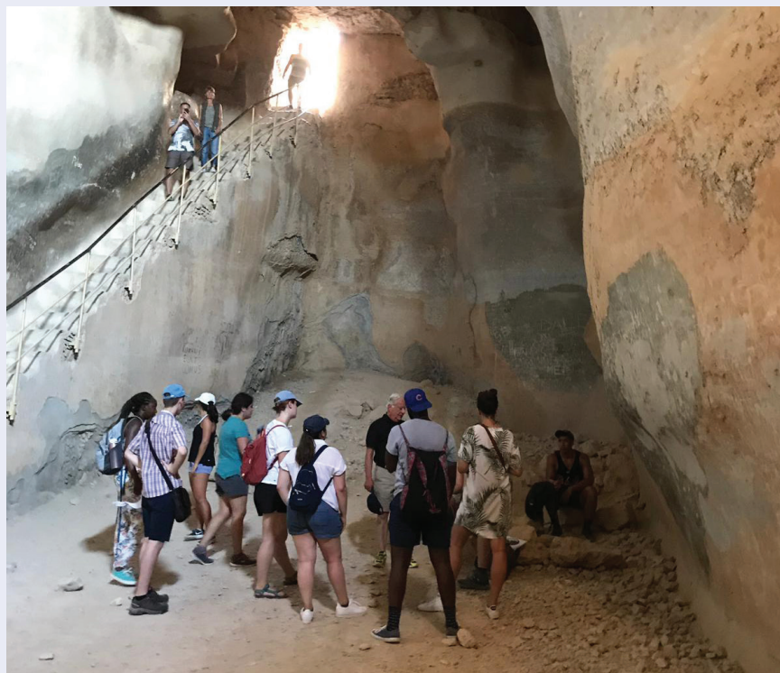
Israel Global Engineering Trek