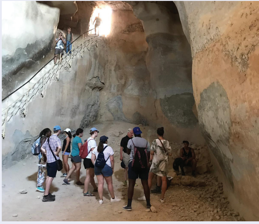
Israel Global Engineering Trek