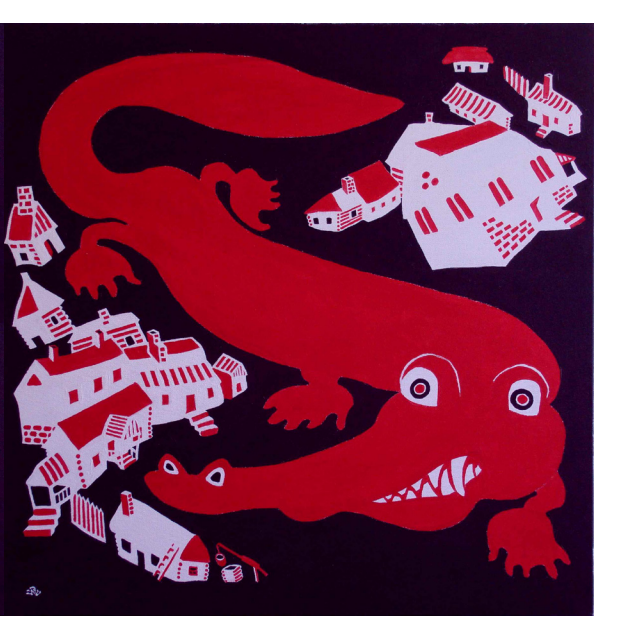
Above: Pogram in a Shtetl, 2007 Top right: Self-Portrait, 2009 Bottom right: Elephant in Berdychiv, 2007

At first he painted animals—bold, fantastic images of a violet wolf in a landscape, then a green elephant surrounded by villagers that seemed to come straight from his unconscious. He incorporated Hebrew letters into the scenes, which he has continued to emphasize in his works, and then began painting typically Ukrainian scenes populated by Cossacks, clowns, and circus tamers.